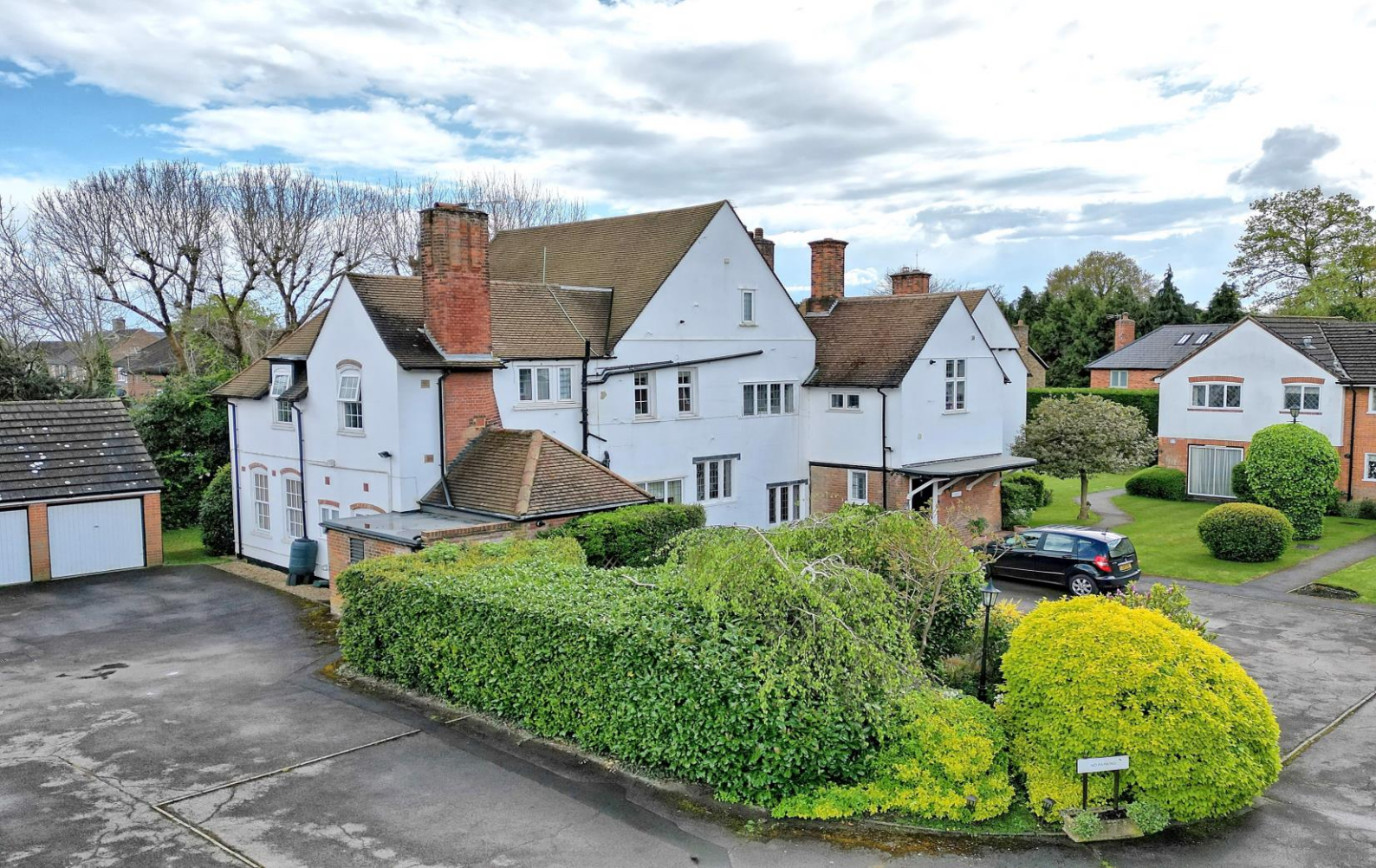
2 Tunmers House, Narcot Lane, Chalfont St Peter, Buckinghamshire SL9 8TL